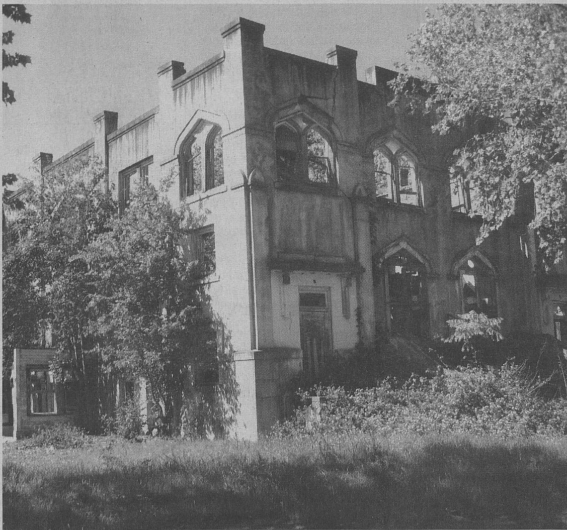
The city has been looking into cleaning up the property above, 320 Church Street, but has run into problems due lack of cooperation of property owners.